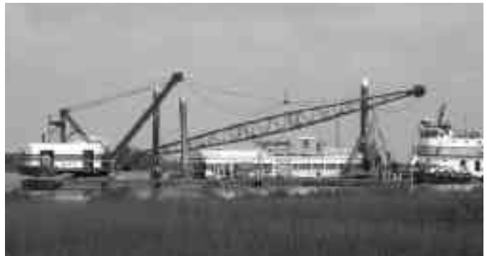
Dredging operations for the test-pile program officially began May 7 near the existing Leeville Bridge.

Provided all of the permits and funding are in place, construction on phases 1A and IB, which includes two-lanes of the bridge and elevated highway from Leeville to Fourchon, is scheduled to begin in early 2005.