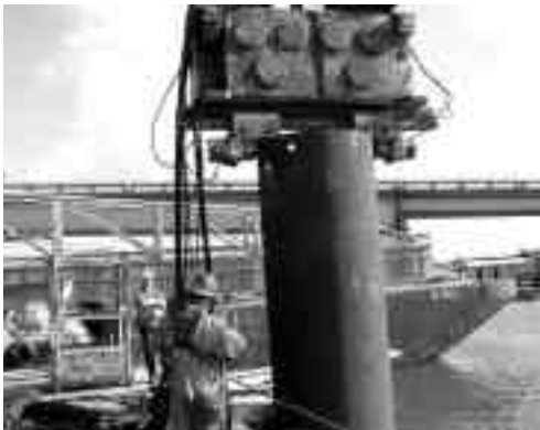
Test pile casings are placed near the Leeville Bridge.