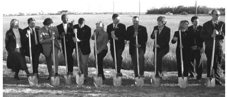
Federal, state and local leaders attended a March 24 groundbreaking ceremony for the new Leeville Overpass.

In May 2006, LA 1 experienced its highest recorded traffic count.