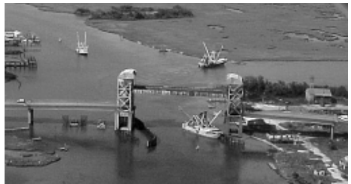
Last fall, a shrimp boat collided into the Leeville Bridge along LA 1, stopping traffic for three hours.